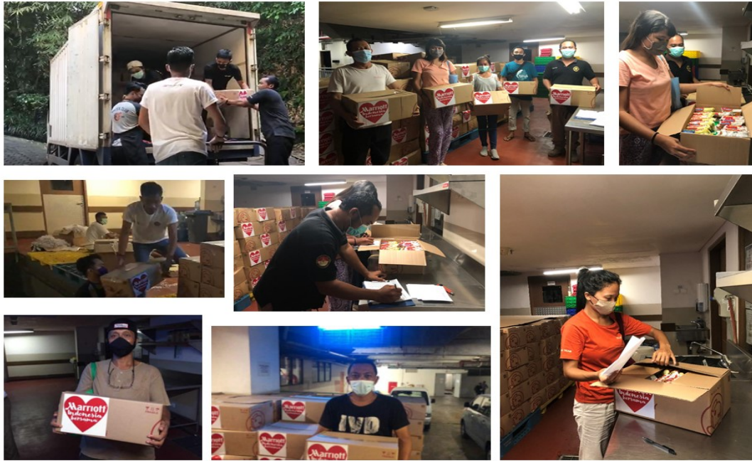
Figure 2. Madapa A Ritz-Carlton reserve donation activities

Activities Involvement in The Ritz-Carlton Public Policy in Bali, namely by giving donations to Banjar Adat. This donation activity is routinely carried out by the hotel every month as part of complying with the customary policies of the local community.