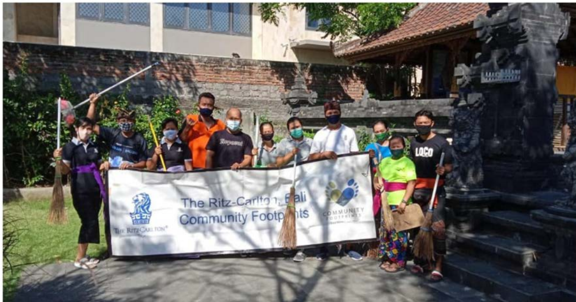
Figure 1. Local temple cleaning activities by The Ritz-Carlton Bali (Source: The Ritz-Carlton Bali, 2021).

The Ritz-Carlton's social investment in Bali is by carrying out cleaning activities for the local temple area, beach area, fully participating in Nyepi celebrations, donating for Nyepi celebrations, releasing turtle calves on the beach and one hour blackout.